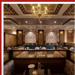
Darbar Indian Restaurant